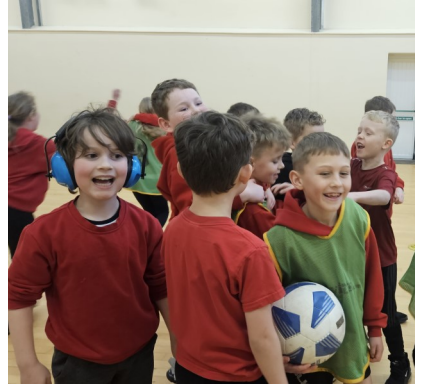
This week's Headteacher's Awards in Year 3 go to: