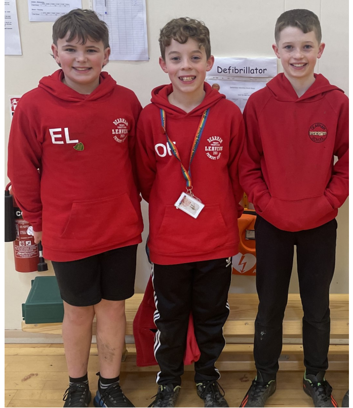
This week's Headteacher's Awards in Year 6 go to:

Well done Year 6—this showed great maturity.