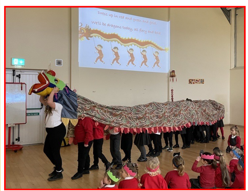
'Gong xi fa cai!' Wishing you all health and prosperity for the year ahead.

Tomorrow, 10th February, people around the world will be celebrating Chinese New Year. We have enjoyed finding out all about this festival and many of us even savoured a special Chinese Junch on Thursday. During our assembly, we re-enacted the story of 'The Great Race,' the traditional Chinese tale which tells of how the Chinese zodiac came about and why the years are named after different animals. This will be the year of the dragon. Our Reception children shared a dragon song and dance with us that they had been practising in class and Year 1 demonstrated the dancing Chinese dragon.