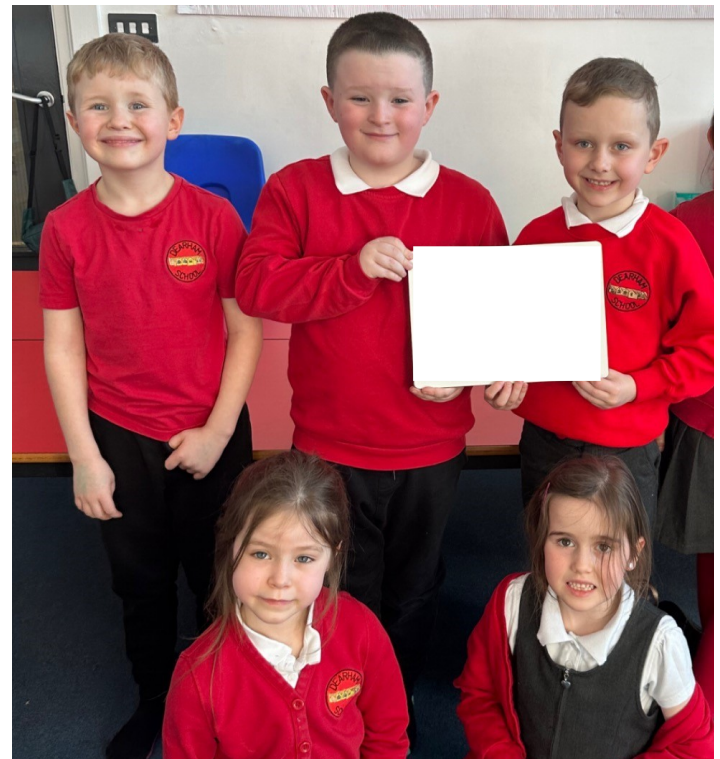
This week's Headteacher's Awards in Year 2 go to: